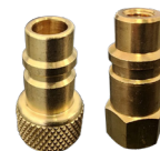
2 tank supply connectors (R134a and 1234YF gas)