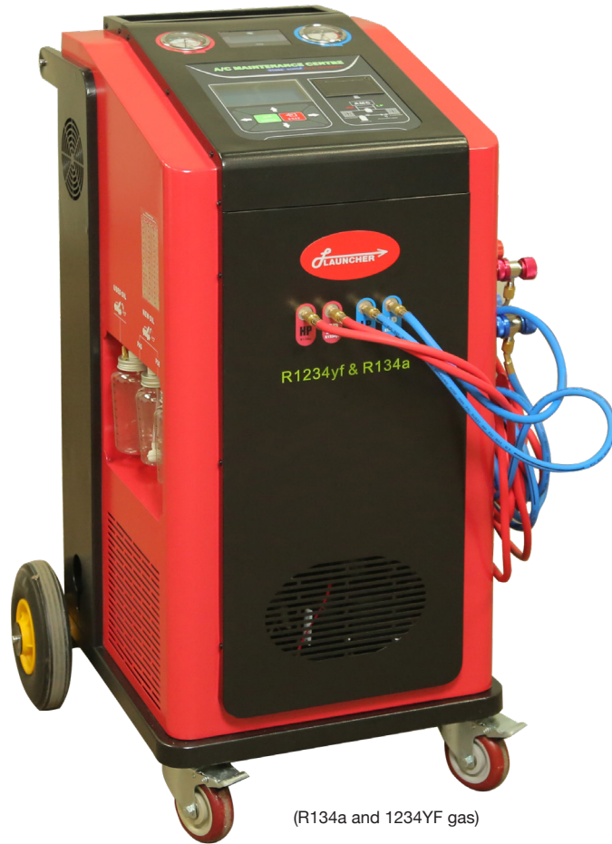
(R134a and 1234YF gas)

LAUNCHER LCH-AC950 PLUS A/C SERVICE MACHINE is an enhanced model of LAUNCHER's best selling AC machine. The same DUAL revolutionary unit recovering, recycling, and recharging both R134a and 1234YF gases is redesigned with a double flushing system for zero gas cross contamination and with cost-saving accessories.